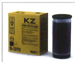
RISO INK KZ TYPE BLACK